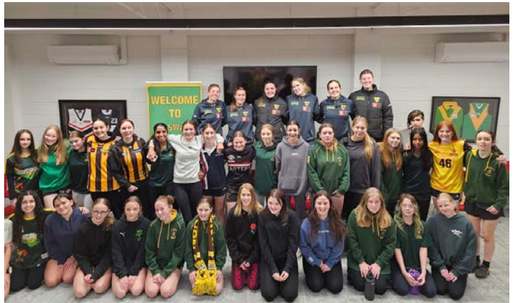
AFLW Player visit - female footy focus