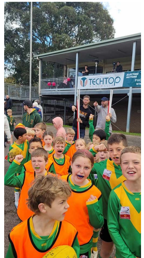
Junior players ready for a half time game at the senior ground