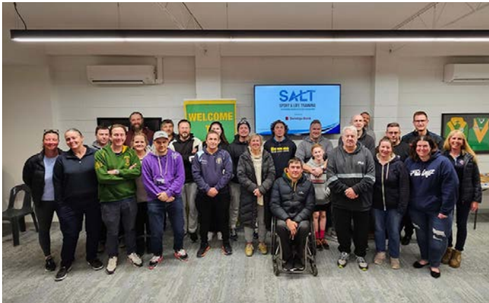
SALT (Sport and Life Training) Coach Development Opportunity