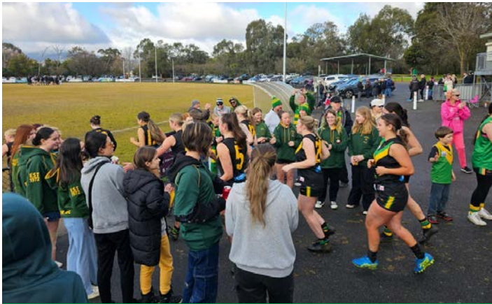
Our Junior girls team supporting the Senior women