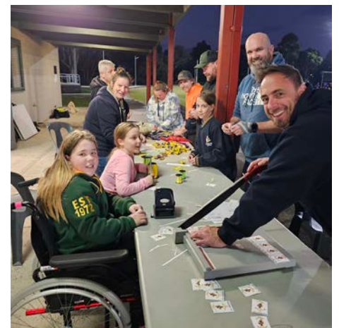
Parents helping with Mothers Day Round